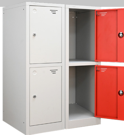
Two doors do not include a hanging rail