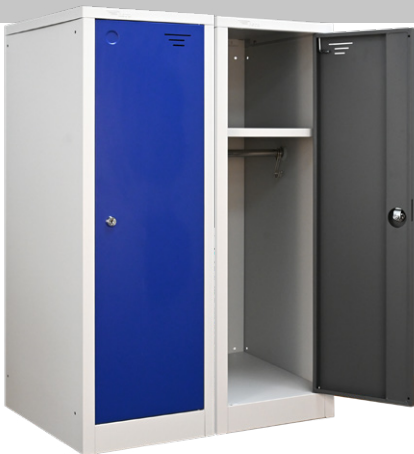
Single door with a top shelf and hanging rail