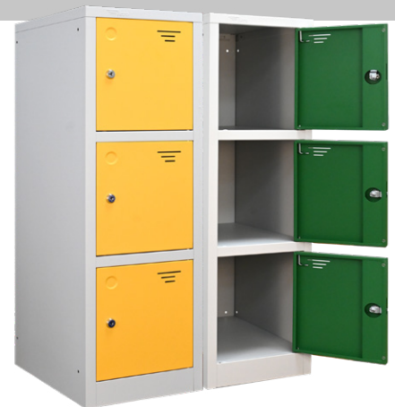
Three doors do not include a hanging rail